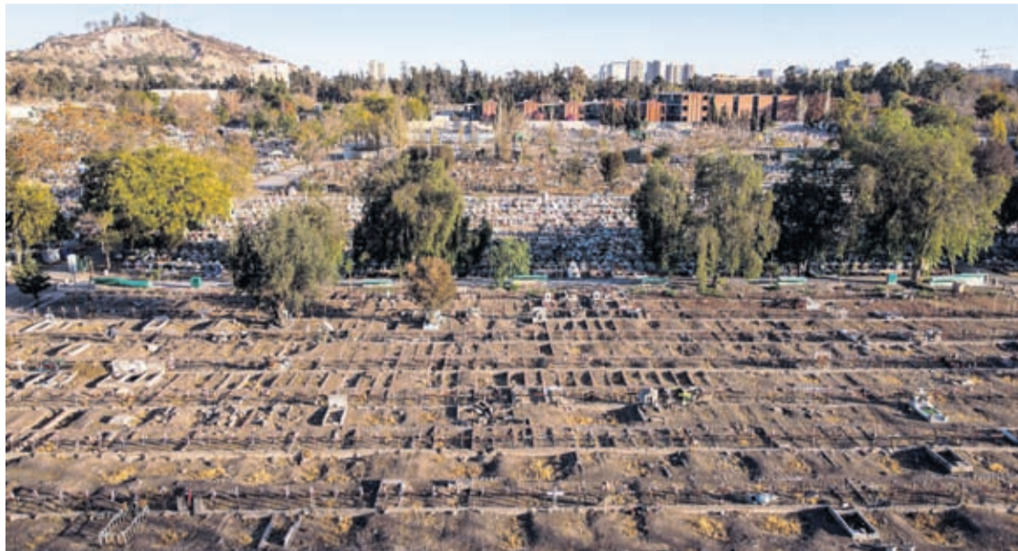
Freshly dug graves are readied at the General Cemetery amid the new coronavirus pandemic, in Santiago, Chile, Friday, May 15, 2020.